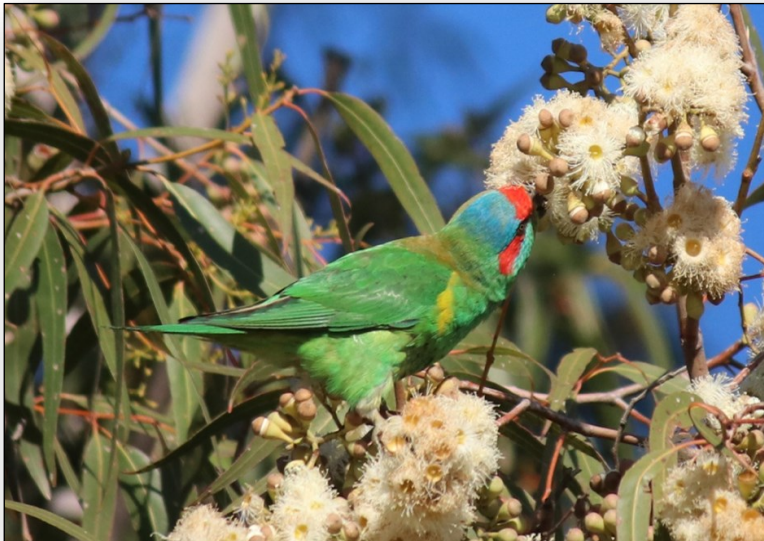
Photo: Musk lorikeet at Morundah

A special thank you to those who have sent information and photos about the local flora and fauna in our region – it all helps to tell the story of the Yanco Creek System.