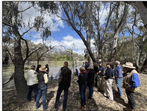
Group meeting on the Billabong Creek at Conargo.

This was followed by another event the following week which included members from the NSW Environmental Trust and three members of the Technical Advisory Group. Upper Billabong and Riverina Highlands were also represented at this event and informed attendees of their local achievements and aspirations.